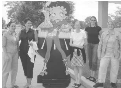
Staff members pose with Betty Boop