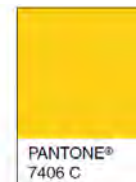
PANTONE® 7406 C