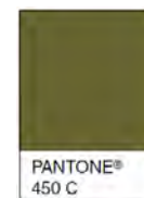
PANTONE® 450 C