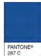
PANTONE® 287 C

If requested by the customer, a 4-color version of the emblem is available for use on merchandise only, when no other version is a viable option. This emblem is not to be used on any of your printed materials, websites, e-mail, etc.